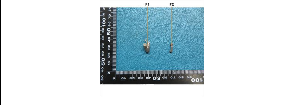
此照片仅限于随 SGS 正本报告使用 ***报告结束***